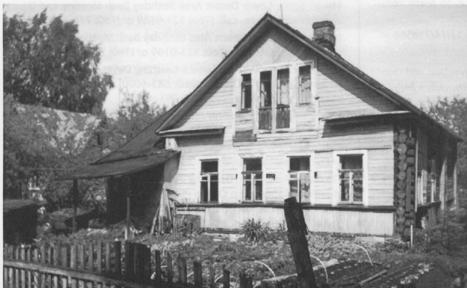
The first NA meeting in Russia, called the "Vertical Group," began in 1990 at this house just outside St. Petersburg.

NA communities are invited to send us photographs of their meeting places. We especially welcome photos that include meeting formats, recovery literature, posters, dirty coffee cups, etc.—anything that makes the meeting place looked "lived-in." Sorry, we cannot use photos that identify NA members. Please tell us about your meeting: the name, the location and city, how long it has been in existence, what your format consists of (speaker, participation, etc.)